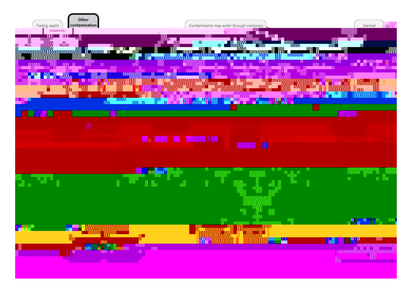
Figure S3. Frequency with which private well system expert codes were mentioned by interviewees (n=18). Numbers within each diagram node represent the number of interviewee mentions, regardless of interview statement accuracy. Thicker lines represent nodes that were mentioned by a higher number of interviewees. Counts were measured by first assigning each diagram node a code. These codes were then assigned to individual transcript statements when relevant.